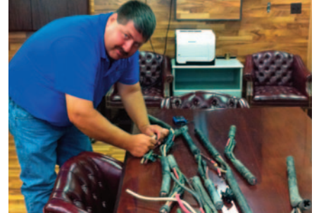
Our mine-experienced field engineers are available 24/7 for on-site evaluation and productivity solutions. They also conduct education and training sessions that address safety, splicing and cable handling practices.

No other cable manufacturer offers this high level of value and solutions!