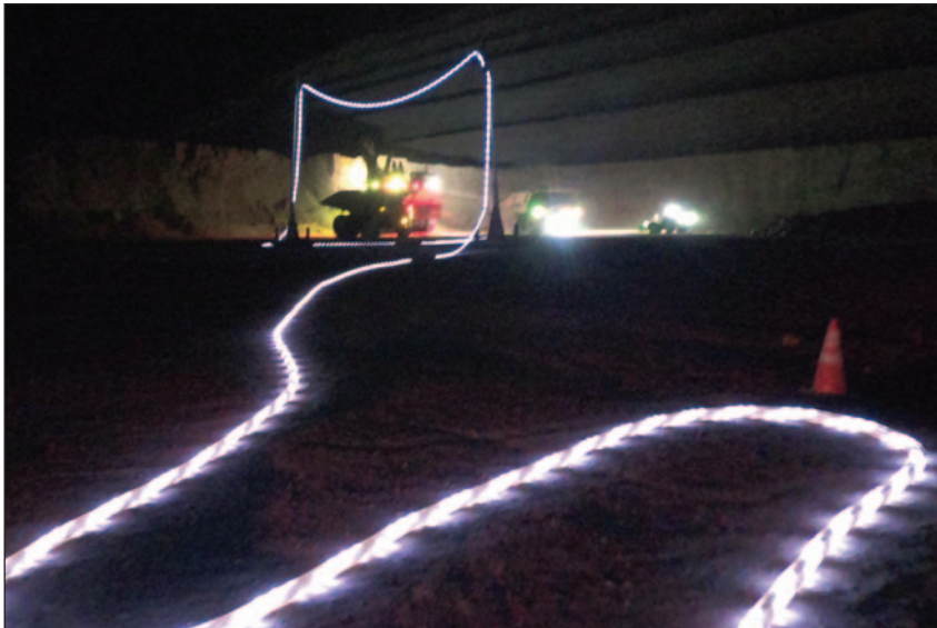
Tiger® Brand ACTIV'LIGHT™ SHD-GC Trailing Cables