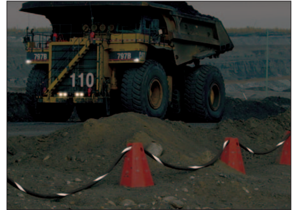
Tiger® Brand CPE Reflective Stripe Trailing Cables